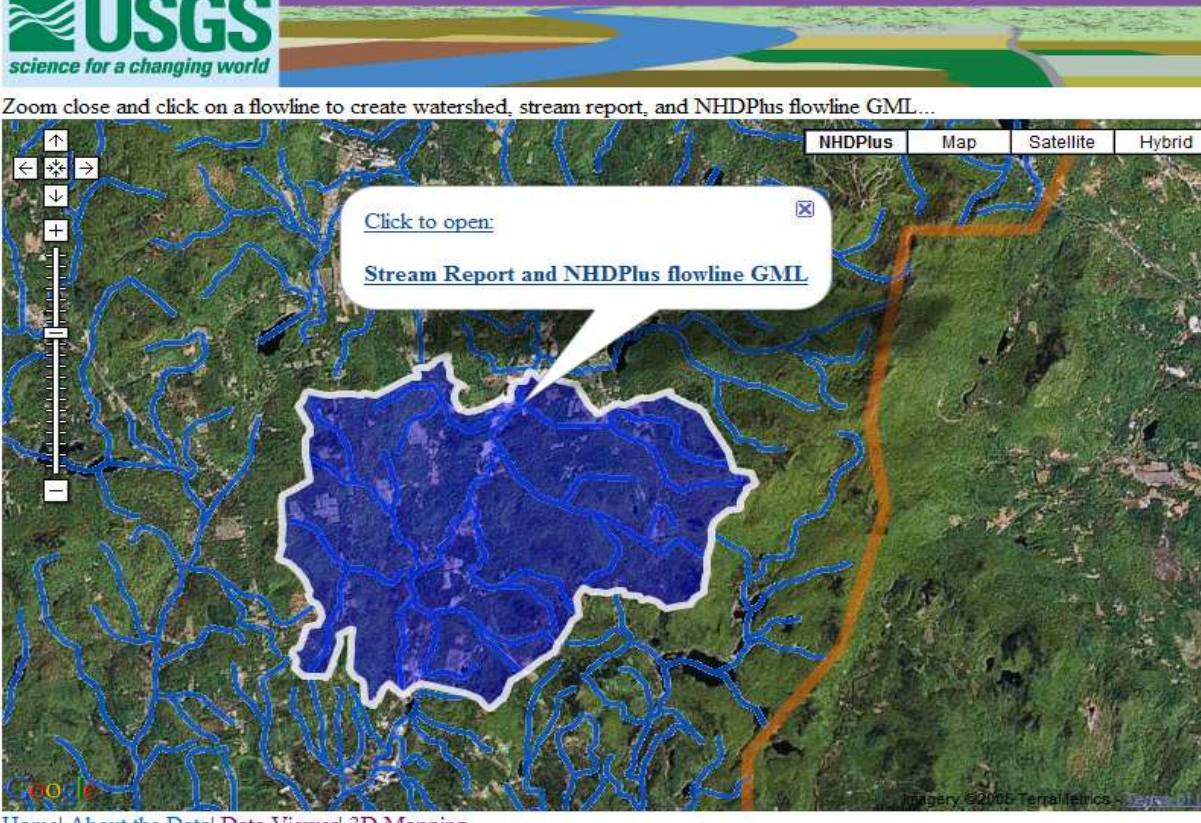
Home About the Data Data Viewer 3D Mapping